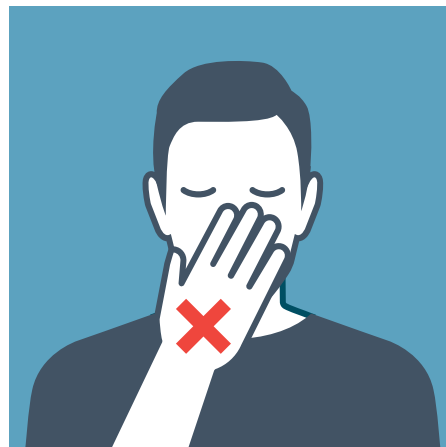
Avoid touching your nose, mouth and face