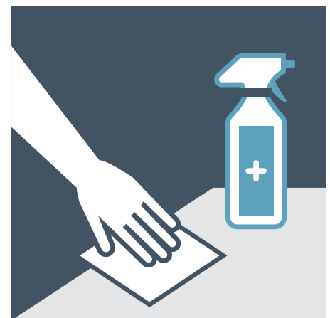
Disinfect all surfaces and work areas with an alcohol-based cleaner