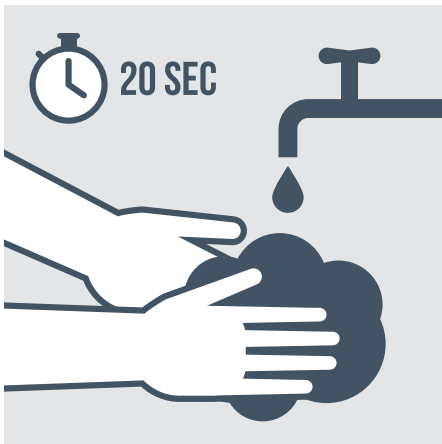
Wash your hands frequently