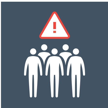
Only ten people or less are permitted in a single room but does not apply to large spaces where cubicles are present